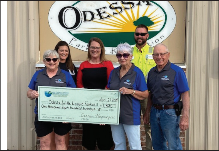
Odessa Little League Football $1,820