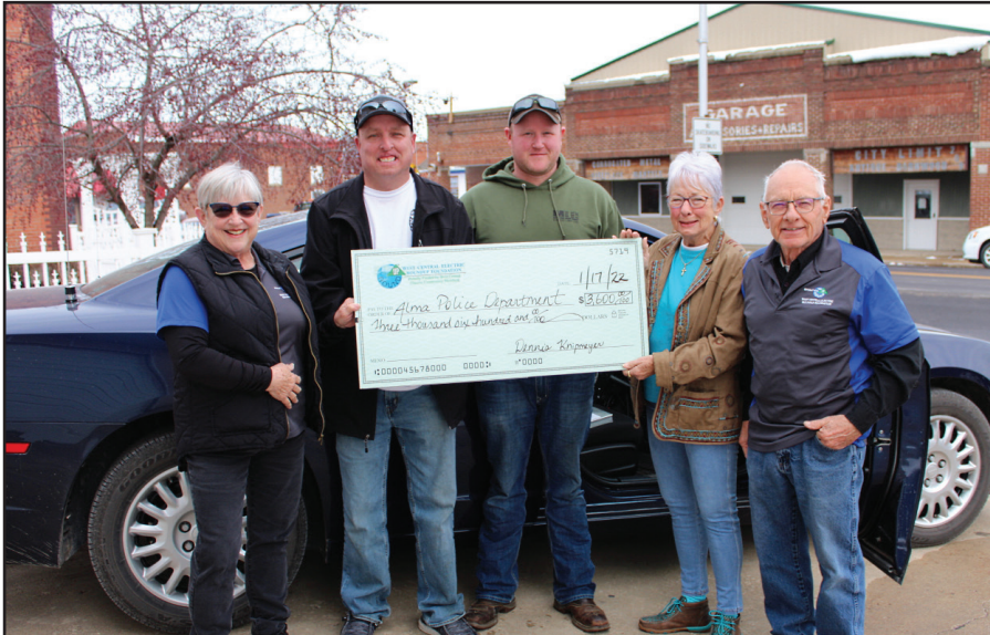
Alma Police Department