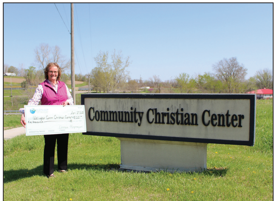
Wellington Community Christian Center