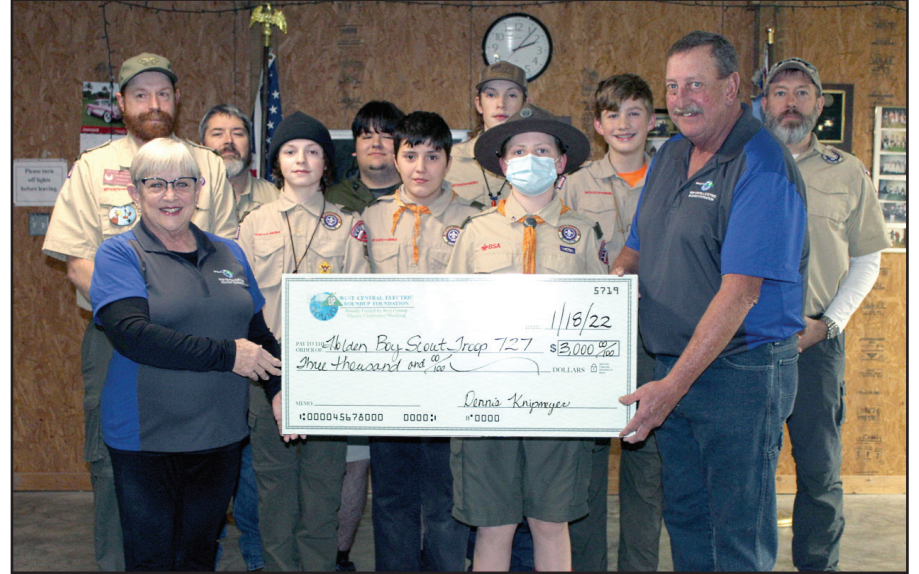
Holden Boy Scout Troop #727