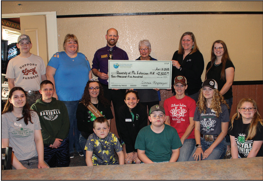
Univ. of Mo. Ext. LafayetteCo. & Johnson Co. 4-H $2,500