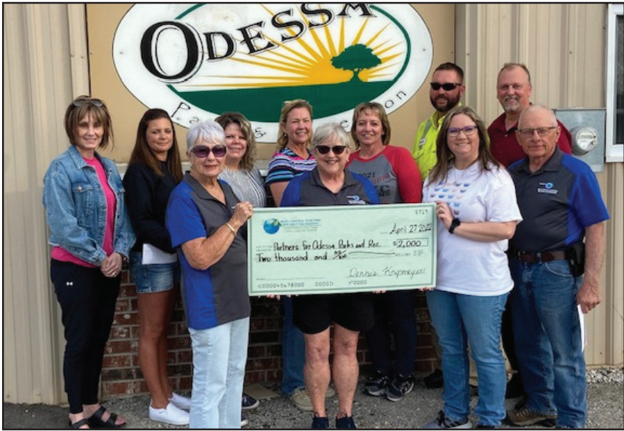
Partners for Odessa Parks & Recreation $2,000