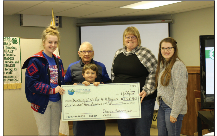
University of Mo. Extension Lafayette Co. 4-H