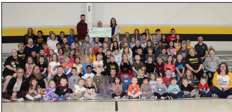
Immanuel Lutheran School